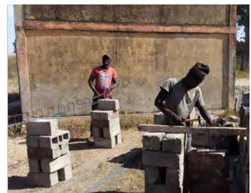
Construction has already started at the Kacothie health post.