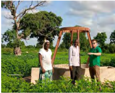
Working with locals eager to get back to work.

We expanded our garden program into five new communities, for a total of 26 gardens serving thousands of people. Three schools received new classrooms, and we kicked-off work at the long-anticipated Keur Soce