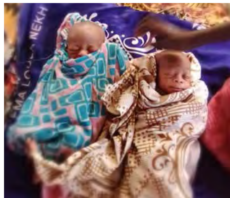
A healthy set of twins born at the Mbantou health post recently.