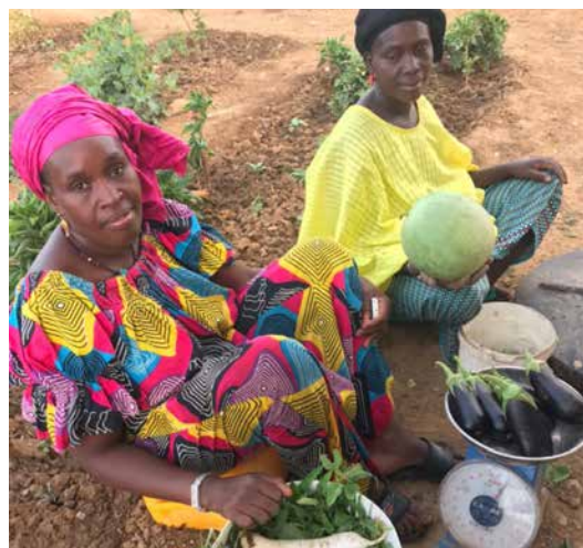
A bountiful and varied harvest of eggplant, melons, turnips, peppers, and greens provide nutritious food to hundreds of families.