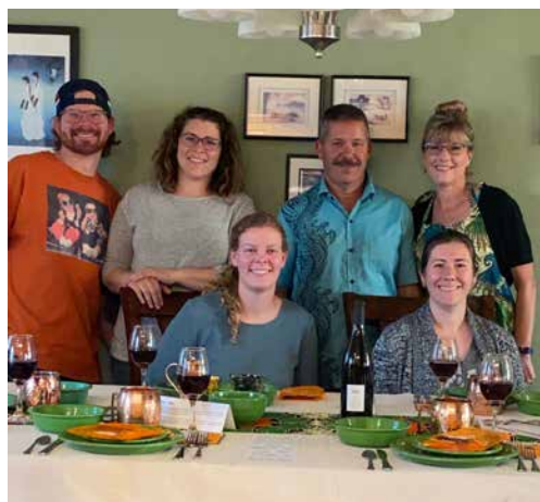
Watch Parties allowed friends and family to gather together in small groups while still participating in the larger event.