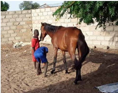
Everyone helps out with the farm, here the boys are harnessing the horse to work in the fields.

The support of farmers also benefits the community. After harvest farmers sell to their community so they also have something to eat, this contributes to nutrition and food security, and strengthens the local economy as well. Everyone benefits from Andando's projects because Andando supports the whole community.