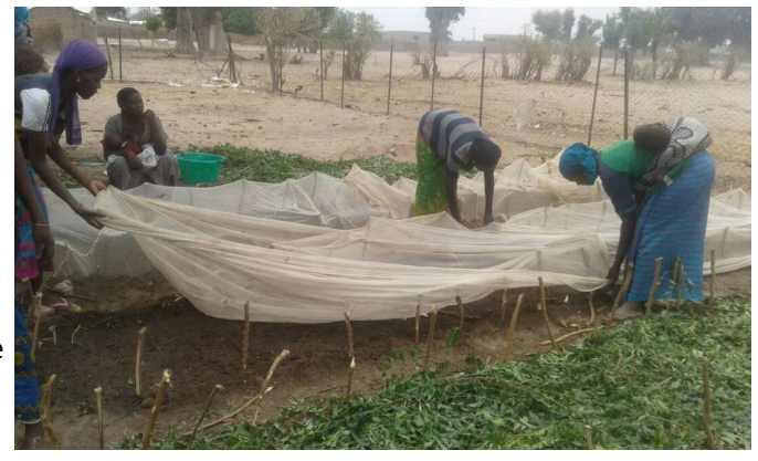
Installing protective netting over a newly established seed bed

All of this came to a head late last month when all of the infrastructure was complete and the water was turned on! It will take some time to develop the garden and be able to utilize all the space and truly make it thrive, but these women have already