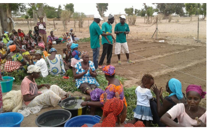
Andando staff during a recent workshop with the women

Working with local leadership and utilizing experienced Senegalese contractors, we constructed fencing, built large-scale water distribution systems, and installed solar-powered pumps that will irrigate the gardens for years to come.