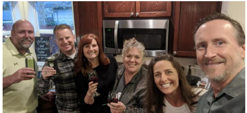
LIVE-STREAM CELEBRATION & PADDLE RAISE October 28, 2021 | 6:30-7:30p

Where: Everything will be online and accessible through our website: